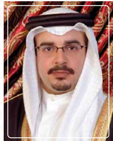
His Royal Highness Prince Salman bin Hamad Al Khalifa The Crown Prince and Deputy Supreme Commander First Deputy Prime Minister