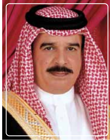
His Majesty King Hamad bin Isa Al Khalifa King of Bahrain