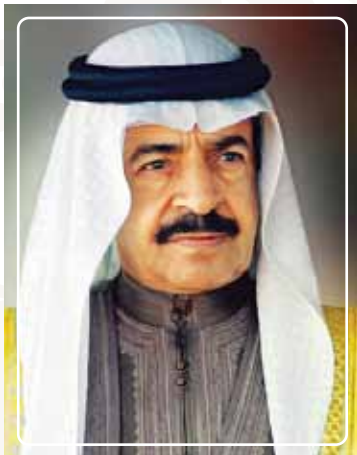
His Royal Highness Prince Khalifa bin Salman Al Khalifa The Prime Minister